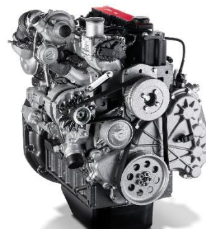
FPT Industrial F28 Diesel

This year, the international jury selected the F28 engine for its combination of winning features: compactness, productivity and environmental-friendliness. The compactness makes this engine the perfect solution for agriculture equipment including specialized and small utility tractors, as well as for light construction equipment, such as skid loaders and compact wheel loaders.