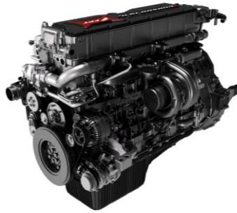
FPT Industrial XC13 Engine

Finally, the members of the judging panel were impressed by the new XC13 H2 engine , the hydrogen-fueled version of the new XC13, the brand's first single-base, multi-fuel engine. From diesel to natural gas – including biomethane – hydrogen, and renewable fuels, the base engine has been designed with multiple versions to offer maximum component standardization and easy integration into the final product. Leveraging the company's extensive experience with alternative fuels, the XC13 hydrogen combustion engine is an additional technology in FPT Industrial's zero CO 2 emission solutions portfolio, offering customers the familiarity they are used to with traditional machines.