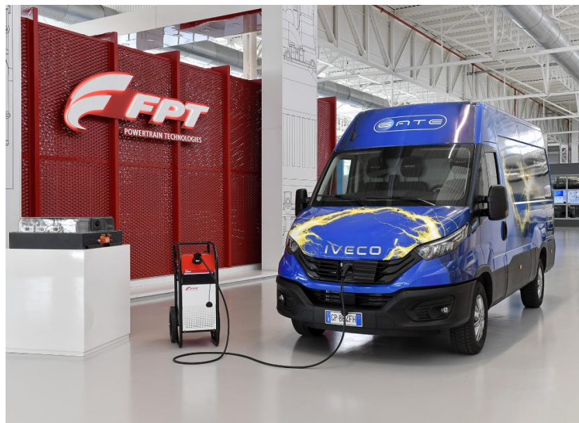
Reefilla's Fillee mobile power bank charging an IVECO eDAILY

The jurors also appreciated the Brand's host of innovative projects in the field of technological development, which are expected to play a crucial role in the foreseeable future, including FPT Industrial's long-term and global approach to full-cycle sustainability, clearly expressed by collaborations such as the partnership with Reefilla , an innovative Turin-based startup offering the first predictive mobile charging service . Together, they launched a pilot project aimed at giving a second life to batteries from commercial electric vehicles .