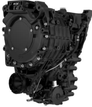
FPT Industrial eAX 300-F front eAxle