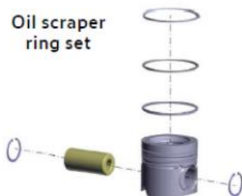
Complete engine pistons