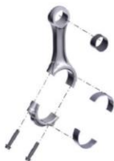
Engine connecting rod and big-end bearings